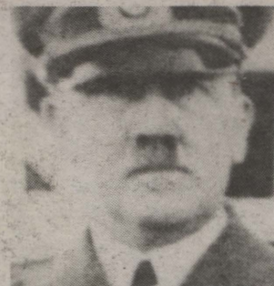
HITLER TRICKED the world into believing he committed suicide.